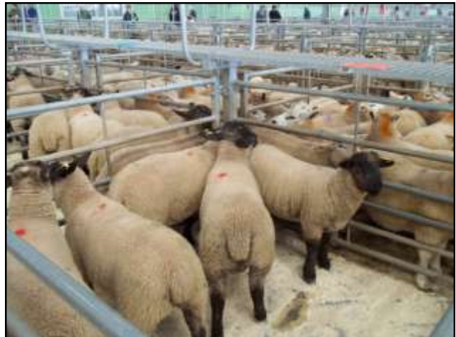
Best pen of Suffolk lambs D W Dale & Son, Boarshill