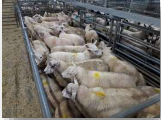
Store lambs at £73

An example of the quality of lambs forward today