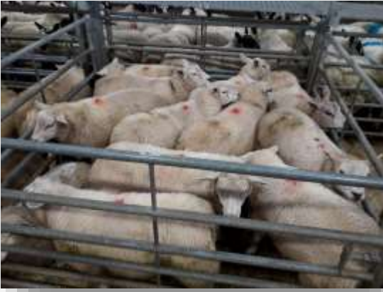
Store lambs at £77